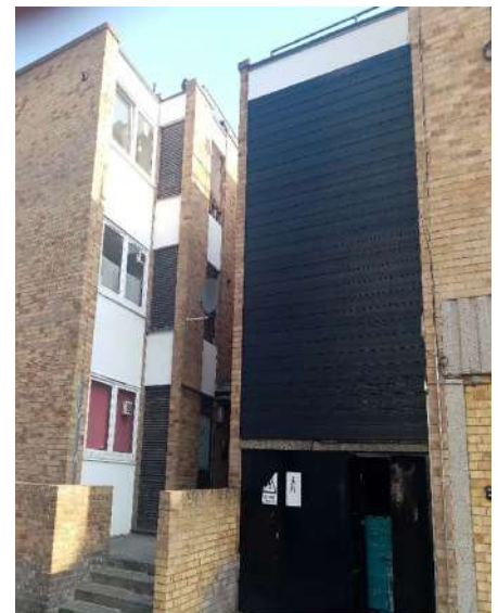
Communal floor repair - Before